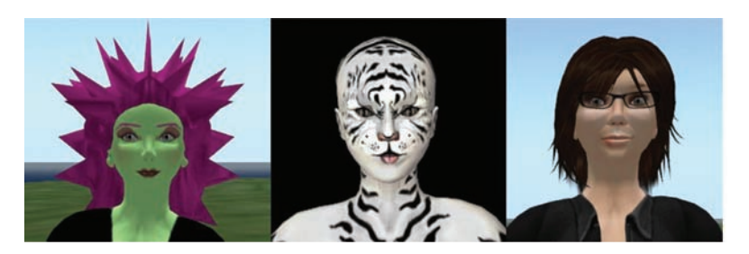
Figure 1. Sample avatars

Spokescharacters (whether humans, drawings or animations) have been successfully used in advertising since the late 1800's. Traditionally, they were associated with low involvement products such as food items (e.g. Pillsbury Doughboy) and cleaning supplies (e.g. Mr. Clean) but today advertisers employ them to pitch high-involvement purchases such as insurance as well (e.g. The Geico Gecko). The effectiveness of characters is well documented (e.g. Shimp 2003; Fournier 1998) many researchers believe that characters improve brand recognition but also play a significant role to create a strong brand personality (Phillips 1996; Mizerski 1995).